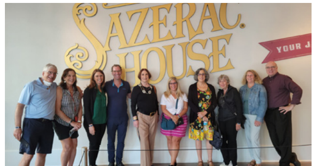
Members of the Mission to New Orleans enjoyed a visit to the Sazerac House.

An exploration of the Jewish South was the theme of our first domestic mission. The group included dedicated leaders from across the country who enjoyed visits to the Museum of the Southern Jewish Experience, The National World War II Museum, and the Whitney Plantation in addition to enjoying the sights and sounds of New Orleans.