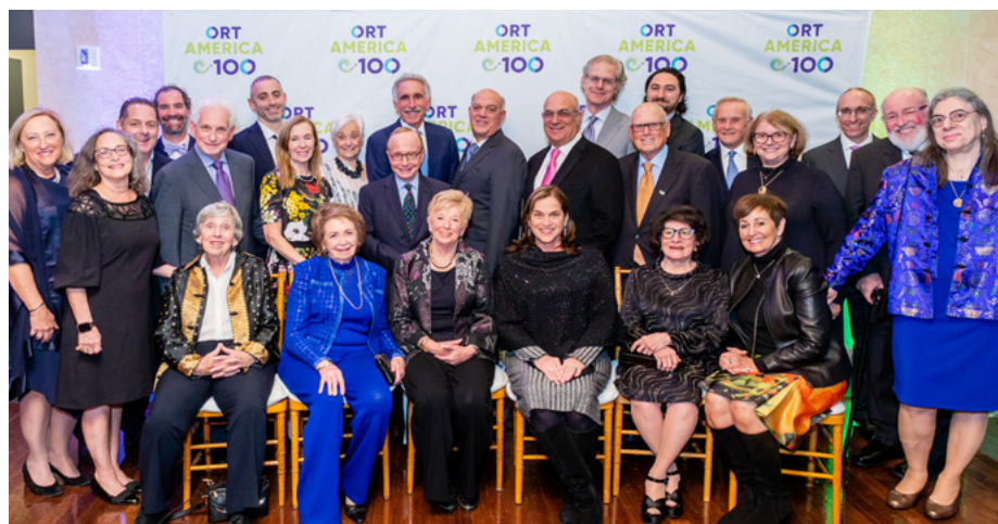
ORT America National Board Members at the 100th Anniversary Gala.